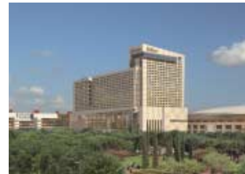
Houston Convention Center Hilton Hotel Retail and Concessions