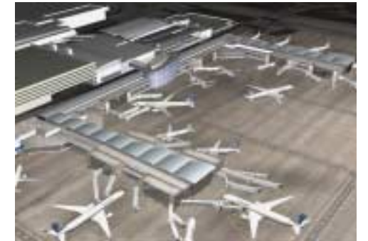
Houston Airport Systems Homeland Security

The following represents projects that WCW routinely performs.