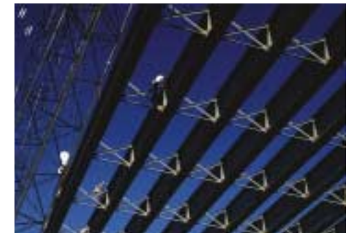
Nigeria and Ghana, West Africa Telecommunications