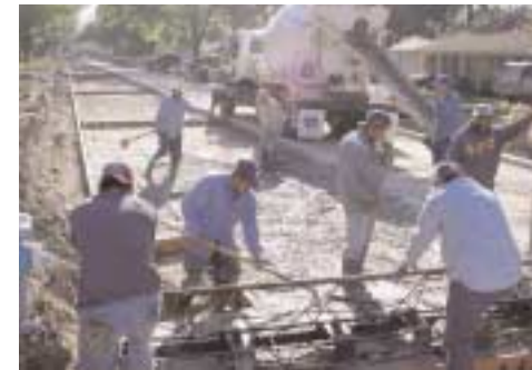
City of Houston Construction Management Street and Bridge